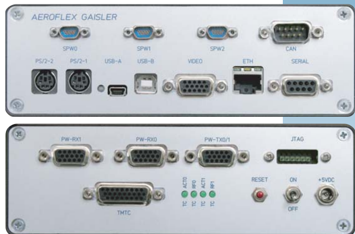
Figure: TM/TC EGSE hardware interfaces (front and back panels)